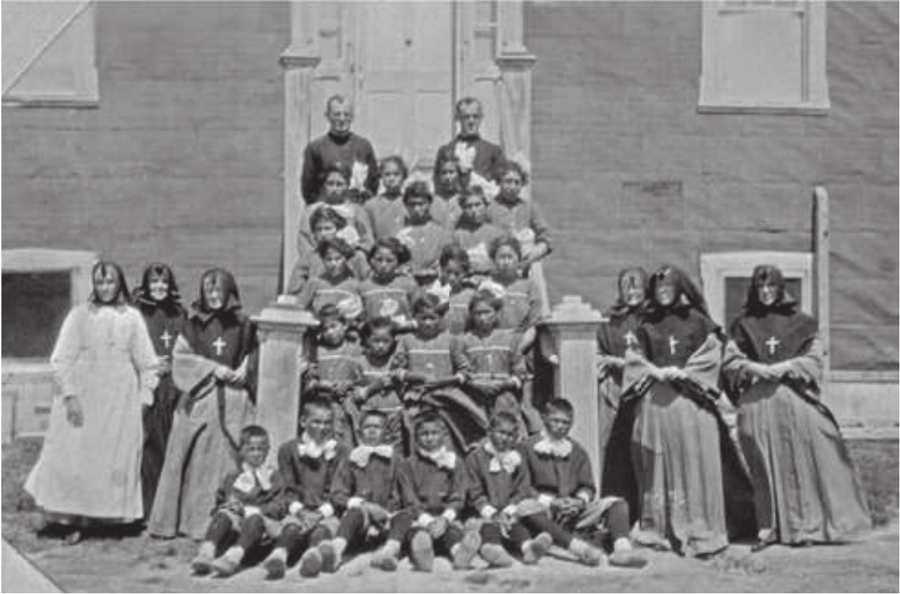
Pupils and staff of the Fort Albany, Ontario, school in 1929.

There were few limits on what might be required of the early school employees. The principal of a Presbyterian school in northwestern Ontario also served as missionary, steamboat captain, and farm instructor. 12 One Catholic principal could “run the farm, the plant, and all the outside work,” but was judged as inadequate, because “the inside drudgery of cooking, mending, sewing, laundry work, taking care of the sick and a thousand other details do not register with him.” 13