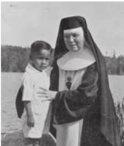
An Oblate sister and child at the McIntosh School near Kenora, Ontario.