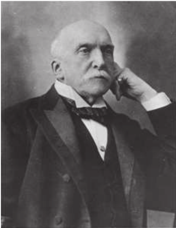
In 1879 Nicholas Flood Davin prepared a report recommending the Canadian government establish a series of residential schools for Aboriginal students in partnership with the churches.

several years, and, it was hoped, provide them with skills that would allow them to earn a living. It was expected that students' attachments to their home communities would weaken while they were at school, and they would not return to their reservations upon graduation, thus contributing to breaking up reservations and tribes. 33