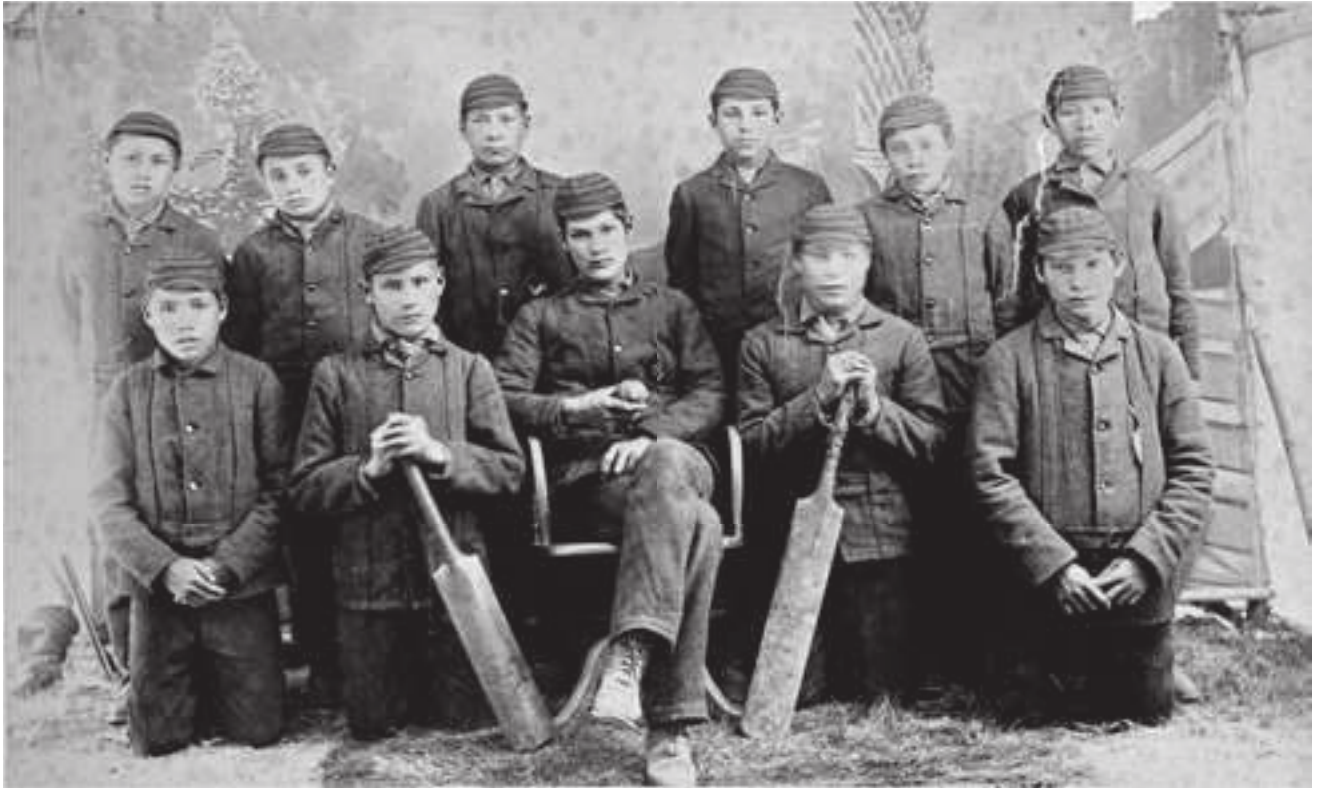
The Battleford, Saskatchewan, school cricket team in 1895. In 1899, an Indian Affairs official wrote of the Battleford school, “A noticeable feature of this school is its games. They are all thoroughly and distinctly ‘white’. The boys use the boxing gloves with no little science, and excellent temper and play good games of cricket and football with great interest and truly Anglo-Saxon vigor.”

the system’s overall failings, but they are also part of the residential school story.