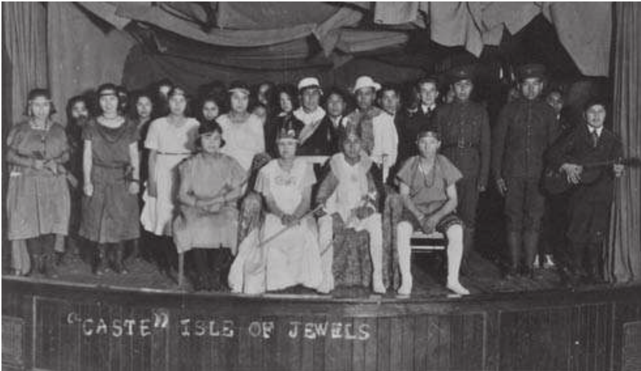
The student cast of the play Isle of Jewels at the Coqualeetza, British Columbia, school. The United Church of Canada Archives, 93.049P424N. (19--?)

Many other Aboriginal leaders attended residential schools, and while they may have developed leadership skills in the schools, they often also became the system's harshest critics.