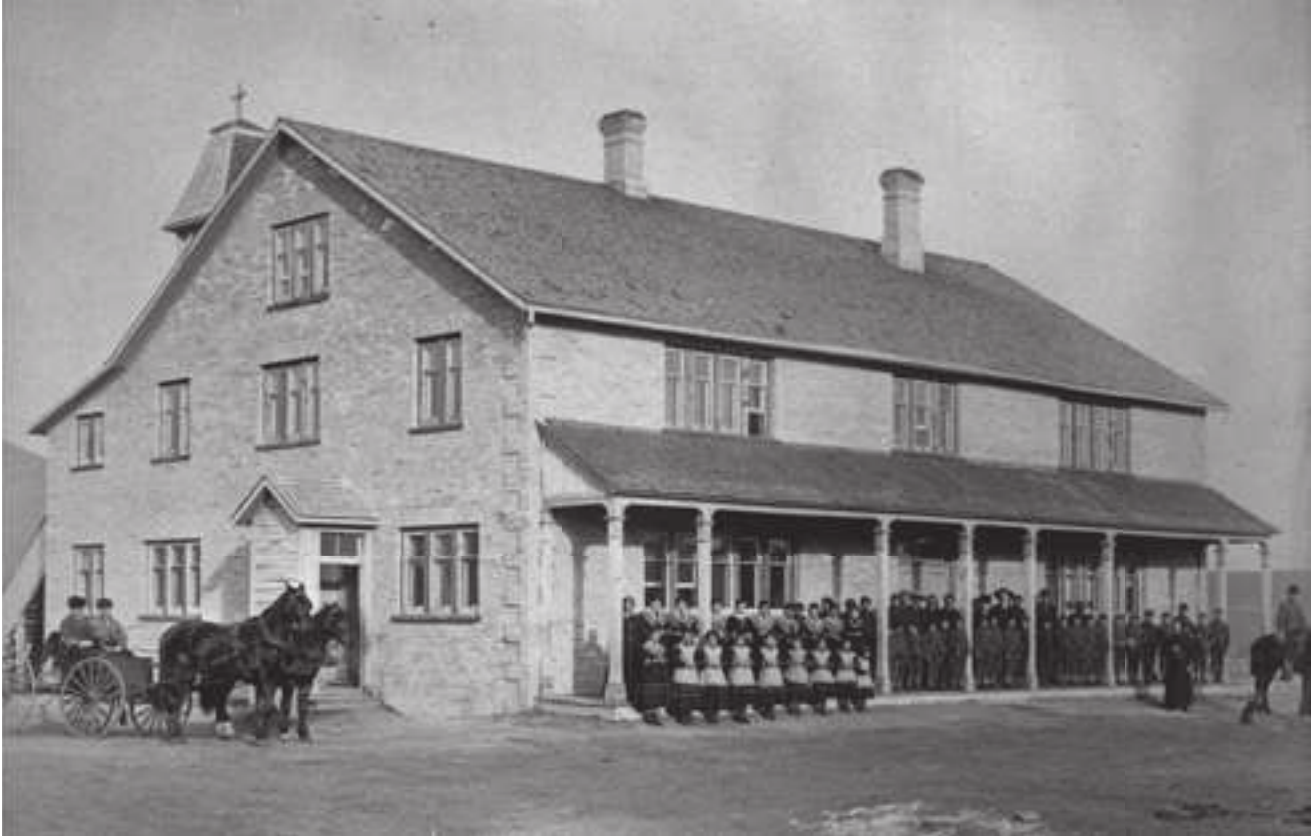
In 1893 the federal government cut its funding for the High River school (pictured here in 1896) from $185.55 per student to $130 per student.