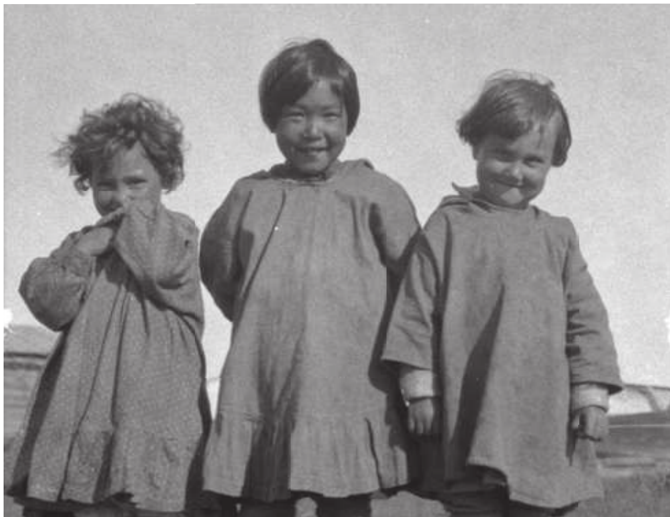
Two Métis children with an Inuit child at the Shingle Point, Yukon, school, 1930.

During his inspection of the Native American boarding school system in the United States in 1879, Nicholas Flood Davin had been impressed by the role that people of mixed ancestry played in the operation of the schools. He concluded that Métis could serve as the “natural mediator between the Government and the red man, and also his natural instructor.” He recommended that the federal government educate the Métis along with First Nations people in “self-reliance and industry” in industrial schools. 1 The Oblate missionaries also sought to use