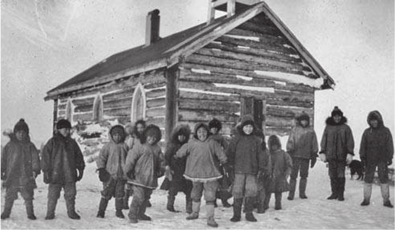
Students at the Shingle Point, Yukon, school playing at recess in the 1930s.