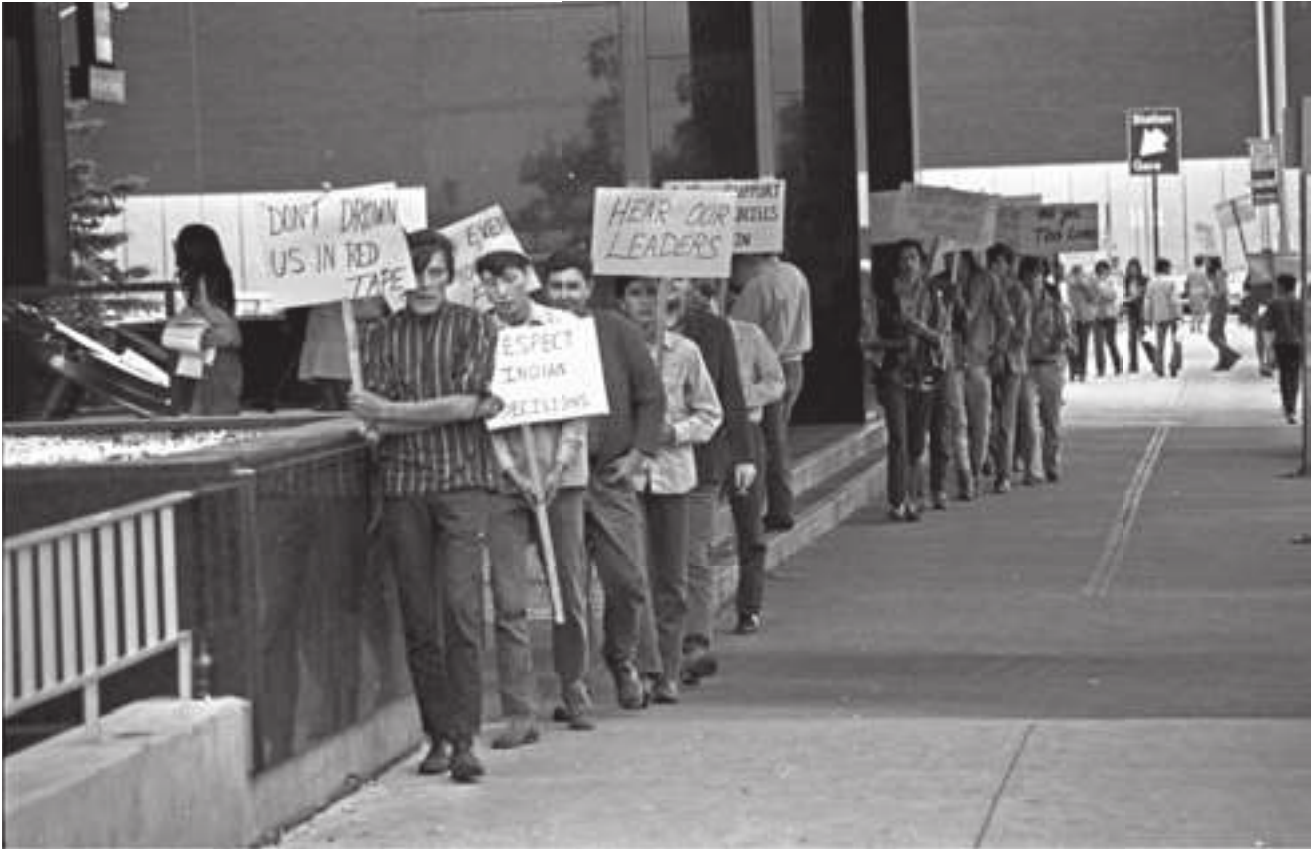
These students are demonstrating in Edmonton in support of a 1970 campaign to have the Blue Quills, Alberta, school turned over to a First Nations educational authority.

make far more money practising their trade than teaching it at a residential school. 94