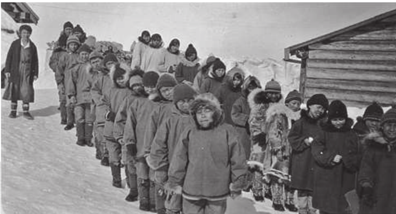
Students outside the school in Shingle Point, Yukon, in approximately 1930.