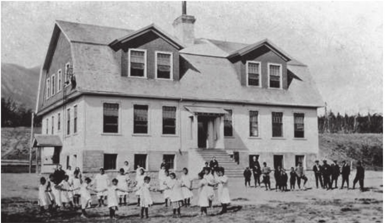
The Choutla school at Carcross in the Yukon was the first government-funded Anglican residential school in the North.