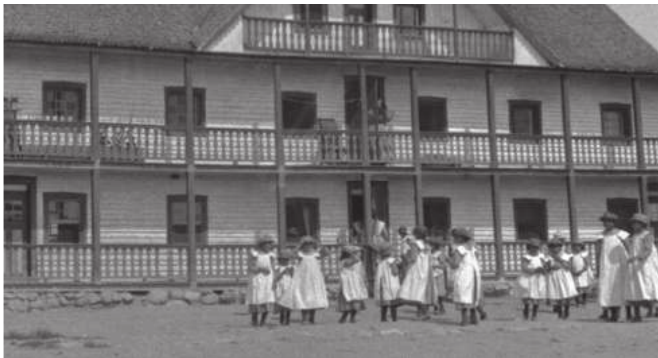
The Sacred Heart School at Fort Providence in the Northwest Territories was established in 1867. This photograph shows children playing at the school in the 1920s.

In Canada, the North has been an ever-shifting concept. In 1876 the North-West Territories included all of present-day Alberta, Saskatchewan, and the Yukon and Northwest Territories, as well as most of present-day Manitoba, Ontario, and Quebec, and Nunavut. As settlement increased, new provinces were created out of the territories, portions of the territories were added to existing provinces, and the territories were subdivided. Today, northern Canada is made up of three territories—Yukon (created in 1898), the Northwest Territories (the name was changed from the North-West Territories in 1912), and Nunavut (created in 1999)—and portions of Quebec and Newfoundland and Labrador that extend into the Ungava peninsula. The Quebec portion of the Canadian North is known as Nunavik, while the Newfoundland and Labrador portion is known as Nunatsiavut. Residential schools operated throughout the North.