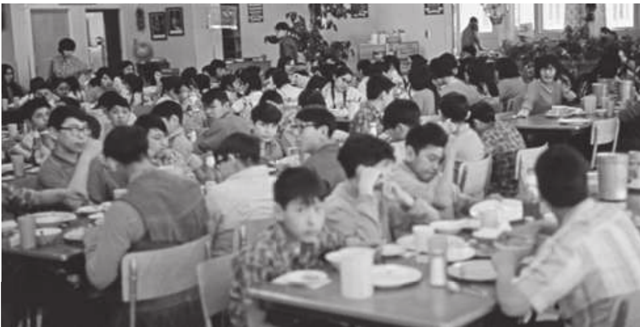
The Stringer Hall dining hall in 1970. Stringer Hall, in Inuvik, was one of the church-operated student residences the federal government built in the 1950s and 1960s. Northwest Territories Archives, Wilkinson, N-1979-051: 0400s.

bid farewell to frightened children, who were flown away to school. 39