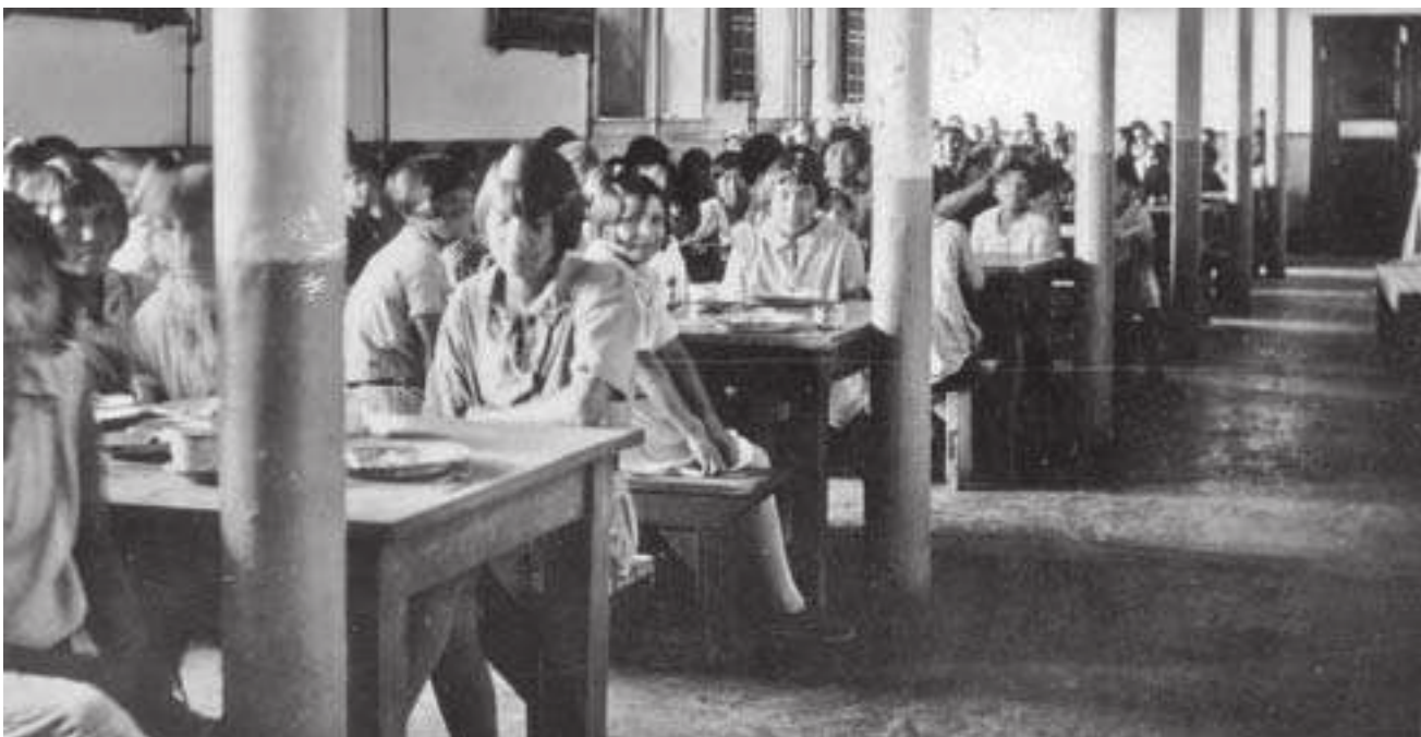
The dining room of the Edmonton residential school (sometime between 1925 and 1936). The United Church of Canada Archives, 93.049P871N.

mornings were spent in front of my bowl of porridge—to this day I can't look porridge in the face.” 101