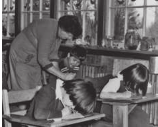
A class at the Alberni, British Columbia, school in the 1950s.

Aboriginal staff members were not always made to feel welcome. When the principal of the Birtle, Manitoba, school married an Aboriginal woman who worked for the school, the couple faced opposition from other staff and the church, which transferred him to a different school. 36 In the 1940s, when the government attempted to have an Aboriginal man appointed principal of the Mohawk