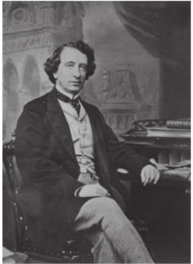
Prime Minister John A. Macdonald, 1868. Macdonald believed it was necessary to separate Aboriginal children from their parents in residential schools. In 1883 he told the House of Commons, "When the school is on the reserve, the child lives with his parents who are savages; he is surrounded by savages, and though he may learn to read and write, his habits and training and mode of thought are Indian. He is simply a savage who can read and write."

Over the next fifty years, the residential school system grew dramatically. By 1931 the government was funding eighty schools. This increase in the number of schools was a central part of Canada's western and northern expansion, and of the colonization of the Aboriginal population of Canada's new lands.