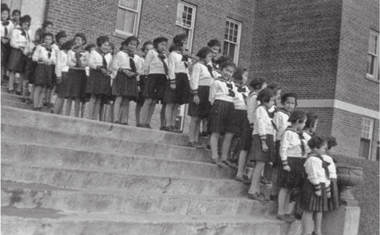
Girls at the Shingwauk school in Sault Ste. Marie, dressed for church in 1941. The federal government and the churches used posed photographs to promote the residential school system across Canada. The image that they give of life at the schools was not always accurate. For example, in 1936, a government inspector noted that at the Birtle, Manitoba, school “all the children have good clothes but these are kept for Sundays and when the children go downtown—in other words when out where they can be seen, they are well dressed.”

are you?’ or ‘25, come here right now!’” 19 A student who attended the St.-Marc-de-Figuery school in Amos, Quebec, felt stripped of her identity: “I was number one hundred and sixteen. I was trying to find myself; I was lost. I felt like I had been placed in a black garbage bag that was sealed. Everything was black, completely black to my eyes and I wondered if I was the only one to feel that way.” 20