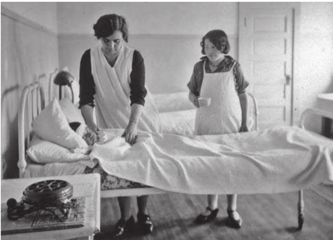
Sick student at the Edmonton school (sometime between 1925 to 1935).