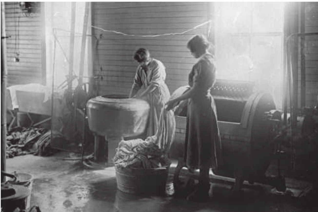
The laundry room of the Brandon, Manitoba, school in 1946.