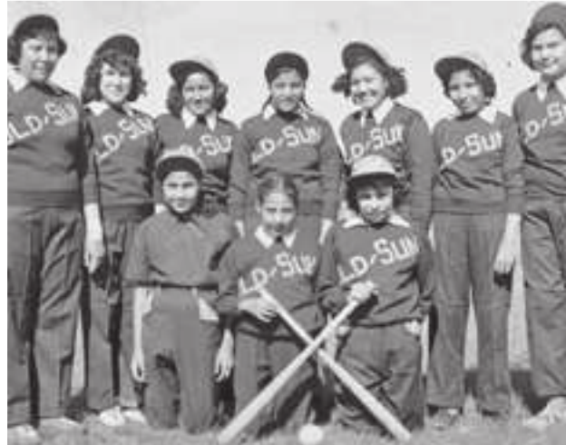
The Old Sun school School softball team in the 1940s.