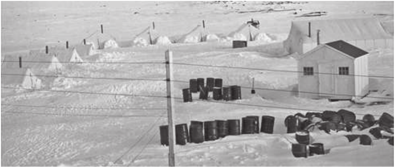
At the Coppermine Tent Hostel, which opened in 1955 in what is now Nunavut, students lived in wood-framed field tents.

dependent on government assistance. 28 Education, it was argued, would give children the skills needed to succeed in the new North that government officials sought to bring into being. The fact that the family allowance, introduced during the Second World War, was paid only if school-aged children were in school provided an additional incentive for parents to enrol their children. 29 The federal government's goal was to provide every school-aged child in the North with the opportunity to go to school by 1968. To do this, it made a major investment in residential schooling. This decision by Northern Affairs to expand the residential school system in the North so dramatically was taken a decade after Indian Affairs officials had begun to wind down the system in southern Canada. Just as on the Prairies, residential school expansion in the North went hand-in-hand with intensified resource development and speculation, and an enhanced military presence.