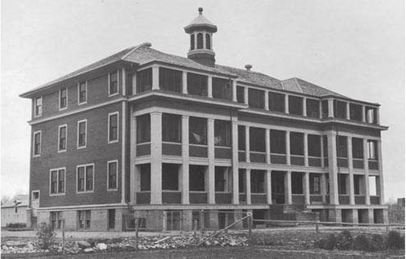
In 1924 an Indian Agent in northern Manitoba said that a boy at the Mackay school in The Pas had been beaten “black from neck to his buttocks.”