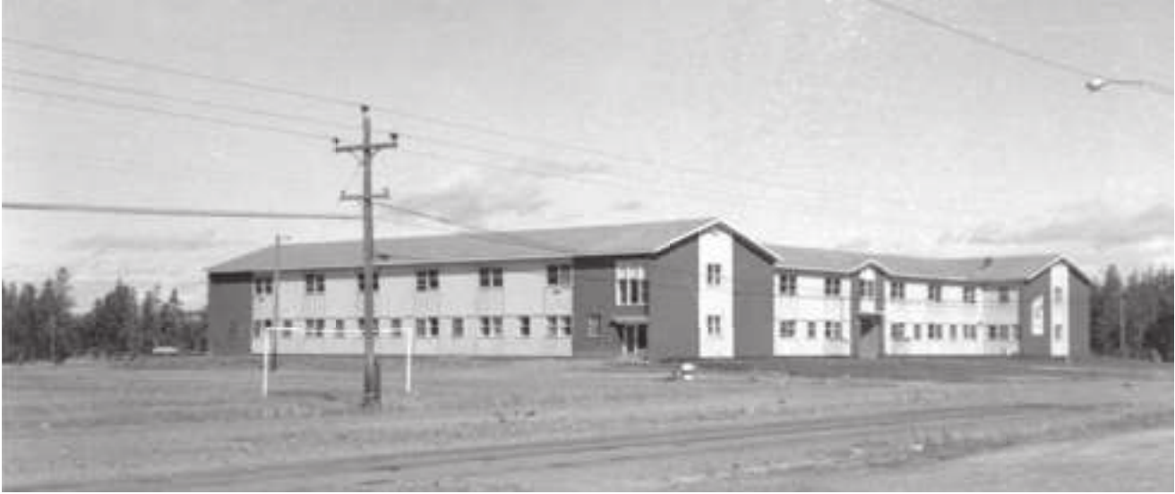
Yukon Hall, the Anglican residence in Whitehorse, Yukon.

federal government on a non-denominational basis. All the schools were intended to be non-denominational, but it was decided to allow the Roman Catholics to operate the Sir Joseph Bernier school and Turquetil Hall residence in Chesterfield Inlet on Hudson Bay. 32