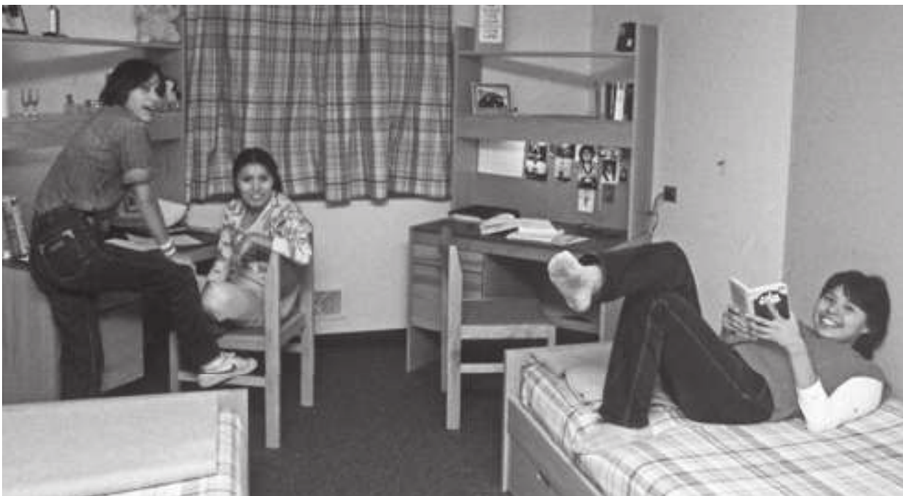
Students in a dormitory room in Akaitcho Hall in Yellowknife, Northwest Territories. Northwest Territories Archives, Northwest Territories. Department of Public Works and Services, G-1995-001: 1605.

consultation, in 1967. Construction began in 1969. At the time, teachers in smaller northern communities circulated petitions opposing the project. The project went ahead with both the school and residence—which had a capacity of 200—opening in 1971. In its early years, the school and the residence had difficulty attracting and keeping students. In 1973 school enrolment was one hundred, and only sixty students were in residence. 60 The hostel remained in operation until 1996, when it and the Cambridge Bay hostel both closed.