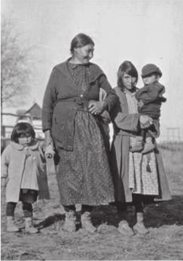
A mother bringing her children to the St. John's School in Wabasca, Alberta, in the 1920s.

law was the one that forbade the speaking of Mi'kmaw even during play.” 39 At the St.-Marc-de-Figuery school in Amos, Quebec, which did not open until 1955, French was the language of instruction. One former student recalled being “forbidden from speaking to my sisters and we were prohibited from speaking our language.” 40