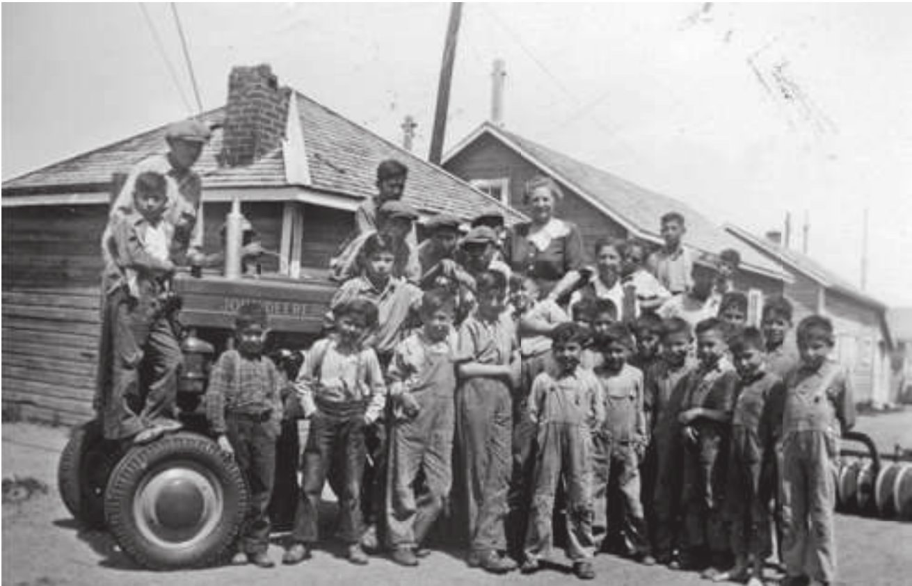
File Hills, Saskatchewan, school, 1948. The half-day system, under which the students often spent half the day doing chores, ended only in 1951. The United Church of Canada Archives, 93.049P1132N.

students. Indian Affairs minister Clifford Sifton concluded it would be better to close the industrial schools, and transfer the students and government support to smaller boarding schools. 73 Concern over the death rates in the residential schools gave rise to a movement within the Anglican Church to end the residential school system completely. In 1908 one of the leaders of this campaign, Samuel Blake, argued that the health conditions in the industrial schools were so dire that the government was leaving itself open to charges of manslaughter. 74 By 1908 federal Indian Affairs minister Frank Oliver had concluded that “the attempt to elevate the Indian by separating the child from his parents and educating him as a white man has turned out to be a deplorable failure.” 75