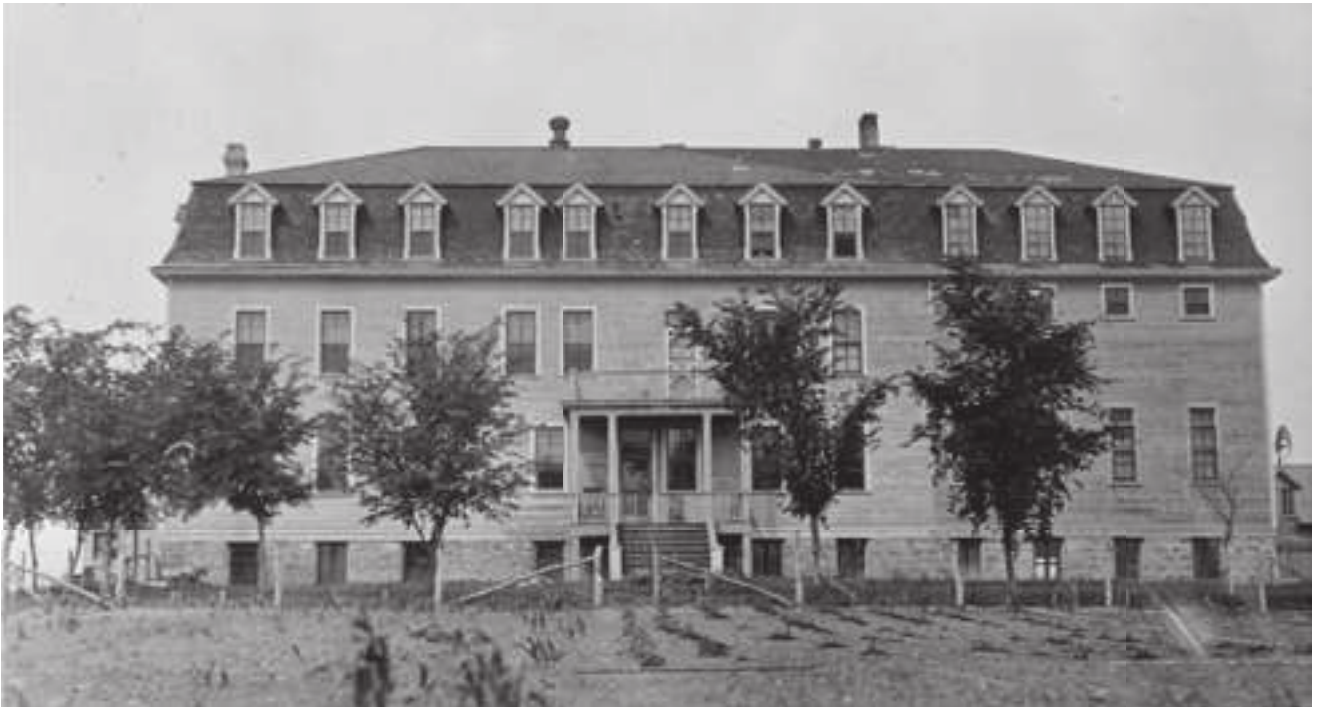
In 1990 Phil Fontaine, the Grand Chief of the Assembly of Manitoba Chiefs, drew national attention to the residential school issue by speaking of the abuse he and his fellow students had undergone at the Fort Alexander, Manitoba, school.

Breaking the Silence: An Interpretive Study of Residential School Impact and Healing as Illustrated by the Stories of First Nation Individuals. Starting in the mid-1990s, former students began making legal claims for compensation for abuse experienced while they were at the schools. By 2002 over 12,000 former students had filed claims. 196