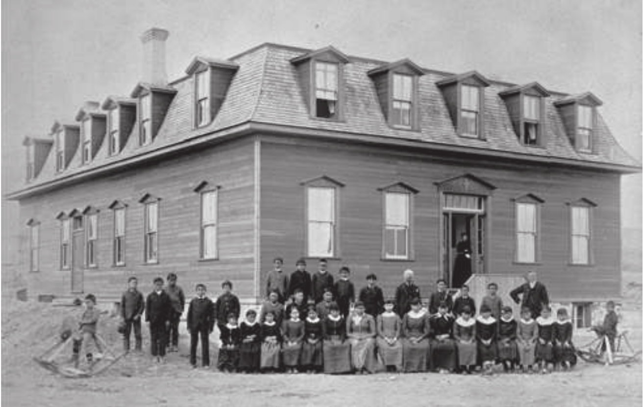
The federal government supported not only the large industrial schools, but also smaller boarding schools, such as this Methodist school in Morley, Alberta, photographed in 1900.

from what is on the whole the degenerating influence of their home environment.” 43