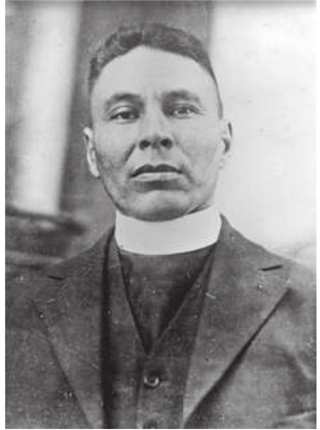
Saskatchewan Aboriginal leaders John Tootoosis (left) and Edward Ahenakew (right) were among the many Aboriginal people who recognized early on the impact that residential schools were having on their students.

poverty, family violence, drug and alcohol abuse, family breakdown, sexual abuse, prostitution, homelessness, high rates of imprisonment, and early death. 1