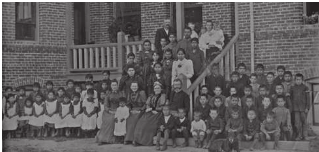
Staff and students of the Coqualeetza, British Columbia, school in the late nineteenth century. (18--?)

For most of the system's history, residential school staff worked long hours for low pay, in locations isolated from their families and home communities. Just as the students were denied holidays, they often were denied holidays. Just as the students put up with unhealthy living conditions, the teachers lived in comparatively spartan settings. They rarely were given the tools to care for children properly, let alone teach them. Many of the positive aspects of the residential school system, then, were the result of their creativity and ingenuity. As a group, they were part of a colonial process that employed a harsh discipline to suppress Aboriginal culture. On the individual level, many were dedicated and made real contributions. Many were young people in search of employment and adventure, with little idea of what lay ahead of them.