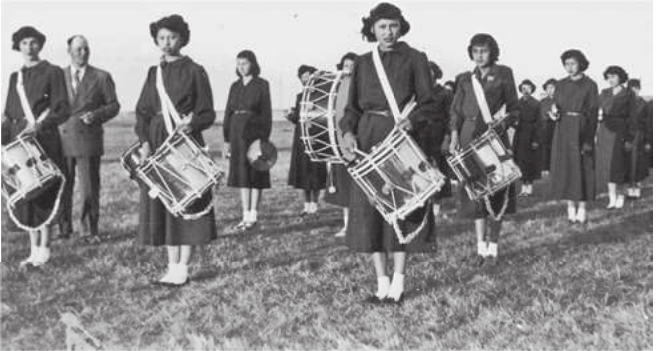
The girls' marching band at the Cardston, Alberta, school, 1952.