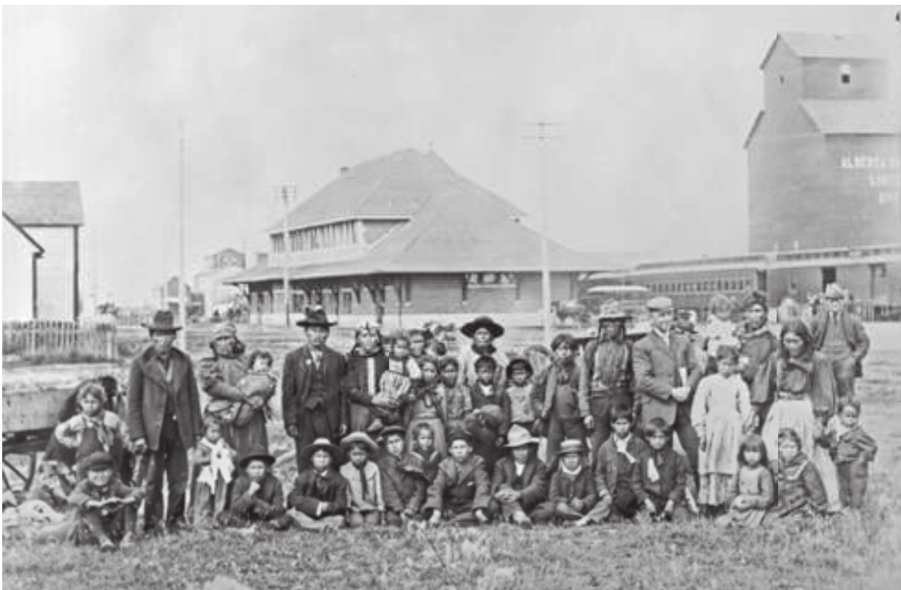
A group of students and parents from the Saddle Lake Reserve, en route to the Methodist-operated Red Deer, Alberta, school.

While church and government officials would have their differences, their overall commitment to civilizing and Christianizing Aboriginal children gave rise to an education system that emphasized the need to separate children from their culture, impose a new set of values and beliefs, provide a basic elementary education, and implant Europe's emerging industrial work discipline.