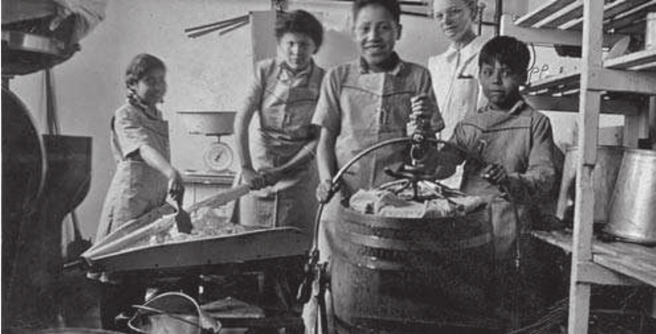
Staff and students making butter at the Old Sun School in Alberta, in 1945.

separators from the schools and allowing the children to drink whole milk. 109