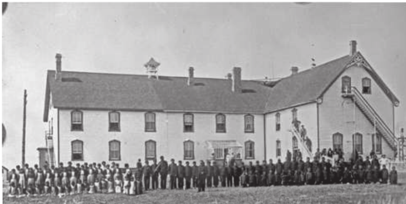
Students played a major role in building the facilities at the Battleford school (photographed here in 1895). In 1889 the principal reported that students had built the bakery and the carpenter's shop, converted the attic to dormitories, and put up a fence separating the boys' and girls' playground.

In 1883, Sir John A. Macdonald, who was both Canada's prime minister and minister of Indian Affairs, moved a measure through his cabinet authorizing the creation of three residential schools for Aboriginal children in the Canadian West. The plan was for two Roman Catholic schools, one at Qu'Appelle (in what is now Saskatchewan) and one at High River (in what is now southwestern Alberta), and an Anglican school in Battleford (in what is now Saskatchewan). 1 In announcing the plan, Public Works Minister Hector Langevin told the House of Commons, "In order to educate the children properly we must separate them from their families. Some people may say that this is hard but if we want to civilize them we must do that." 2