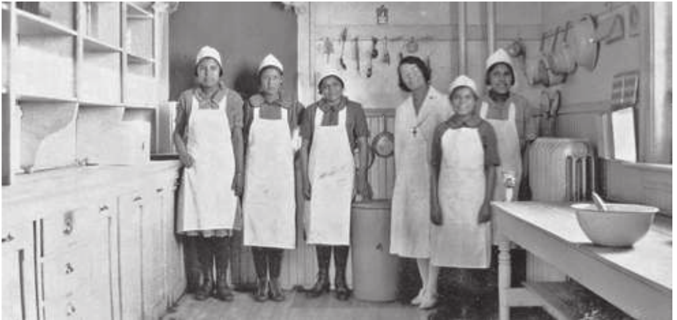
The Elkhorn, Manitoba, school kitchen staff in the 1930s.