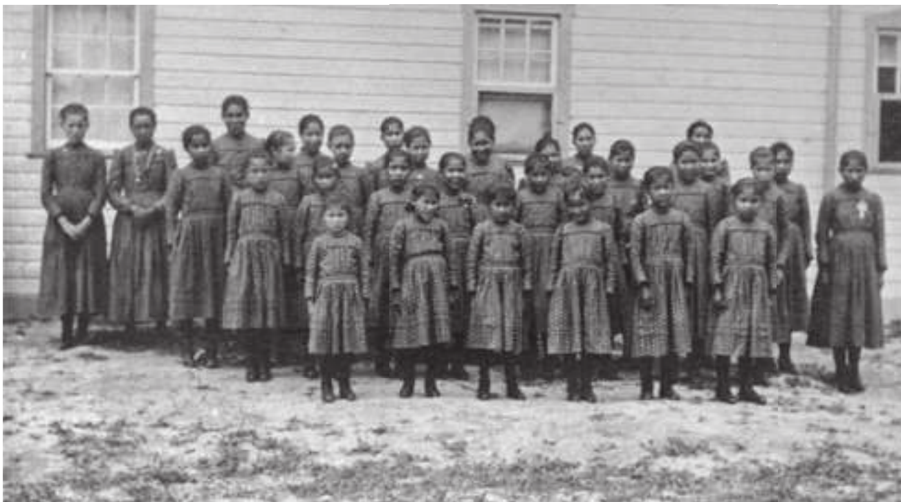
Life was difficult for the teachers and the Métis students at the Île-à-la-Crosse school in the 1870s. The school matron slept on a pallet in the classroom, the female students slept on the floor, while the male students slept in the Oblate residence.