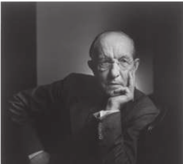
Deputy minister of Indian Affairs Duncan Campbell Scott said in 1920 that he was working for the day when “there is not a single Indian in Canada who has not been absorbed into the body politic.”

each enfranchisement, the number of Indians would decline, and the size of each reserve would shrink.