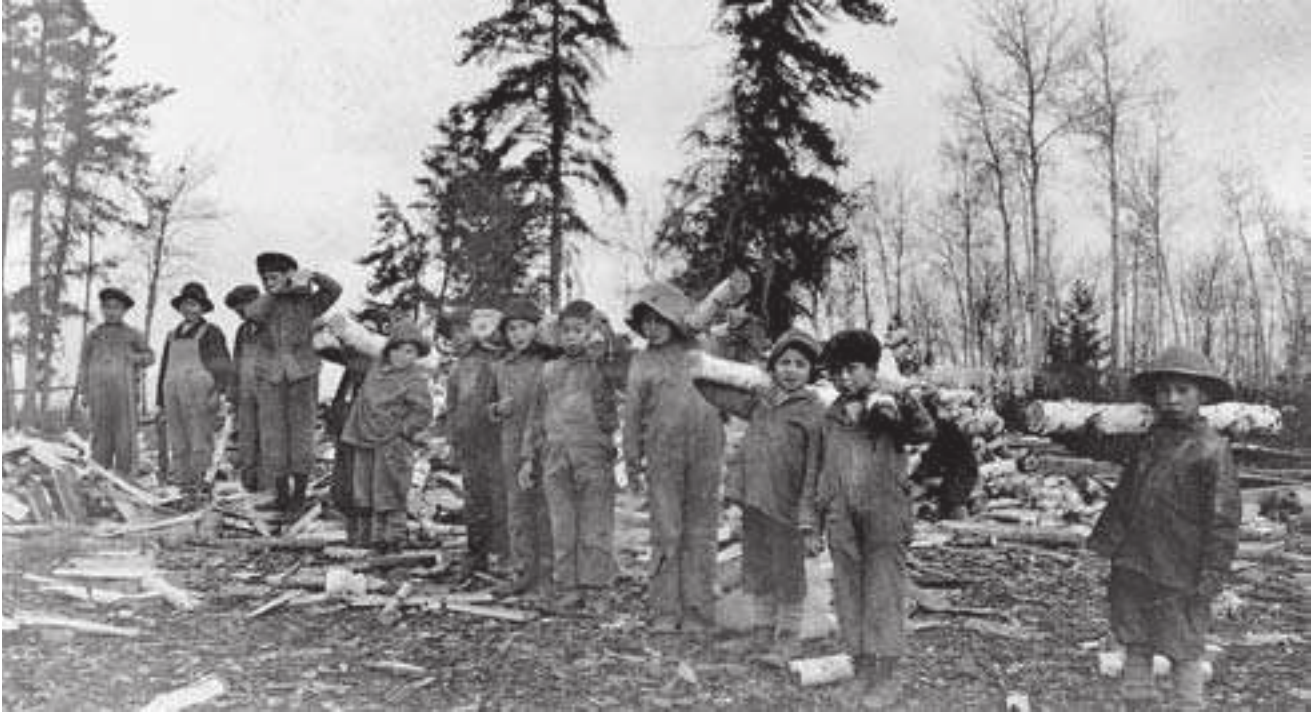
Students at All Saints School in Lac la Ronge, Saskatchewan, carrying wood in the 1920s.

led to embarrassing reports of children scavenging for food in garbage cans. 136