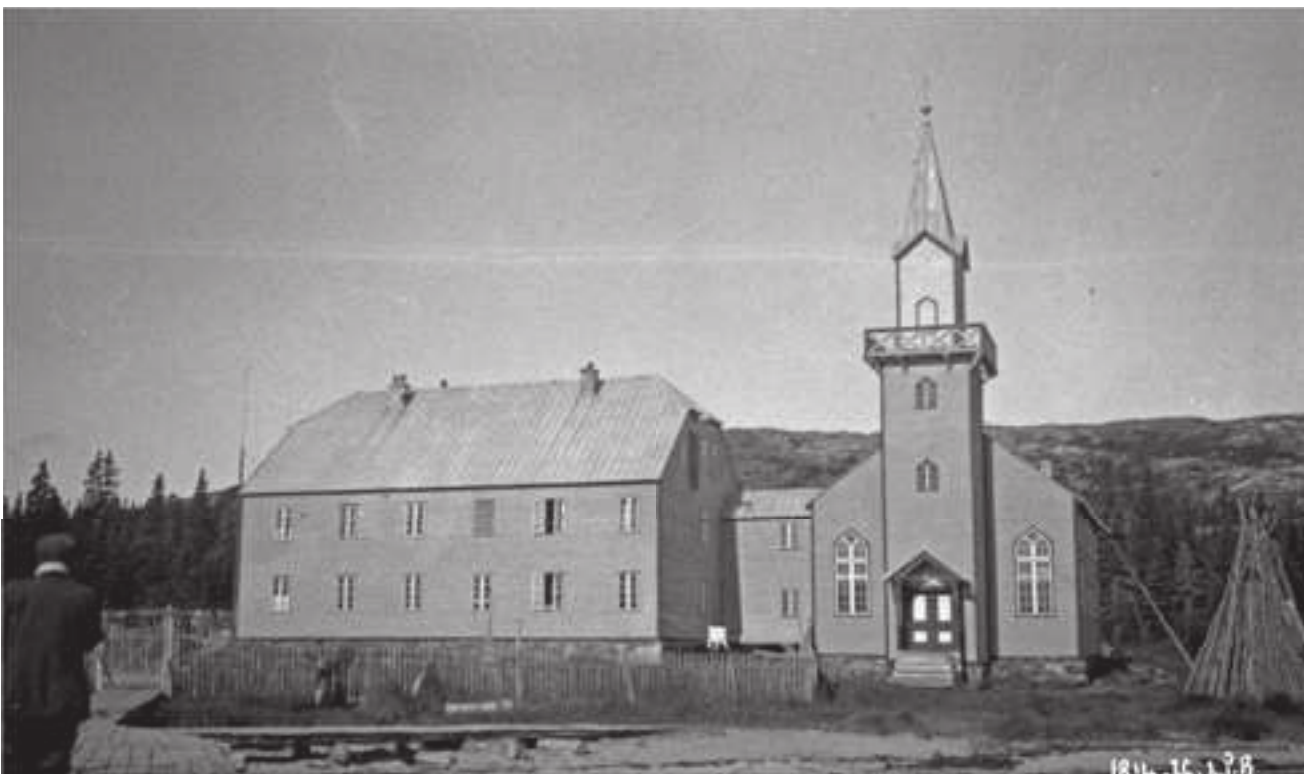
Moravian Church and Mission School, Makkovik, Labrador. September 1926.

But that's the time we found out we couldn't even talk to our brothers! We got punished if we did. And we weren't supposed to talk Indian, Tlingit." 15