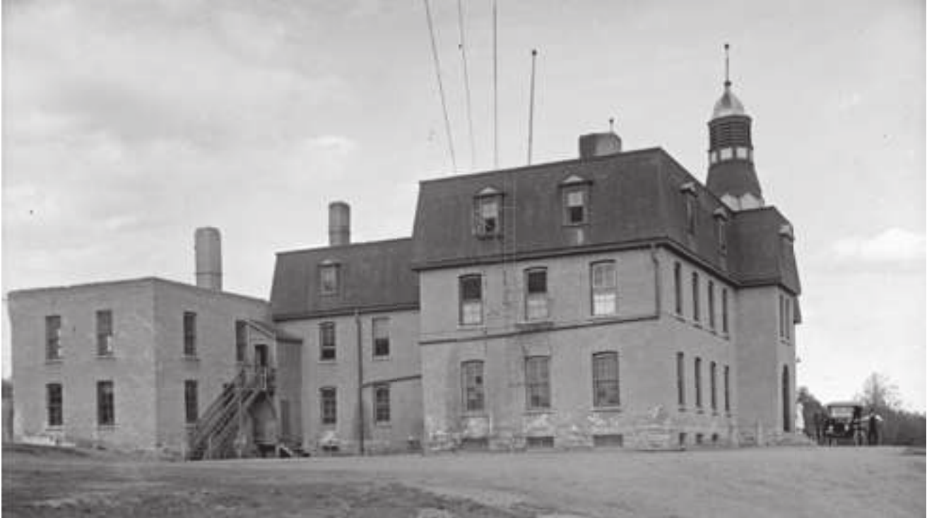
In the 1940s parents in Saskatchewan refused to send their children to the Brandon school because they felt their children were being mistreated at the school.

in Alberta led Indian Affairs to issue a policy directive on corporal punishment, which set out the type of strap that could be used, the number of blows that could be administered (no more than four per hand for students over fourteen), who could strap students, and a requirement that punishment be recorded. 192