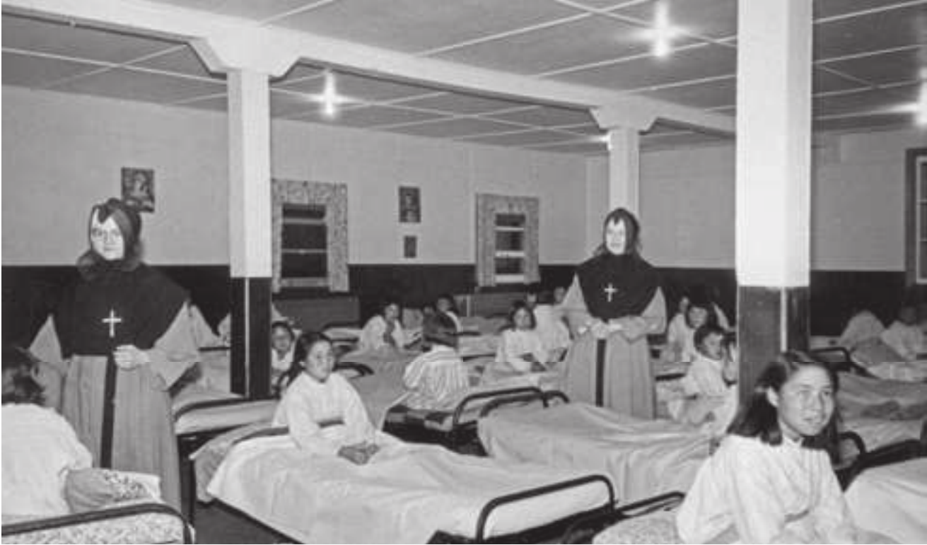
The girls' dormitory, Turquetil Hall, Chesterfield Inlet, Northwest Territories, 1958. Library and Archives Canada, Charles Gimpel, Charles Gimpel fonds, PA-210885.

barge would arrive in Aklavik, loaded with kindling for the school furnace. The students would form a long chain from the barge to the furnace room, and, with the assistance of the school staff, unload the barge. 20