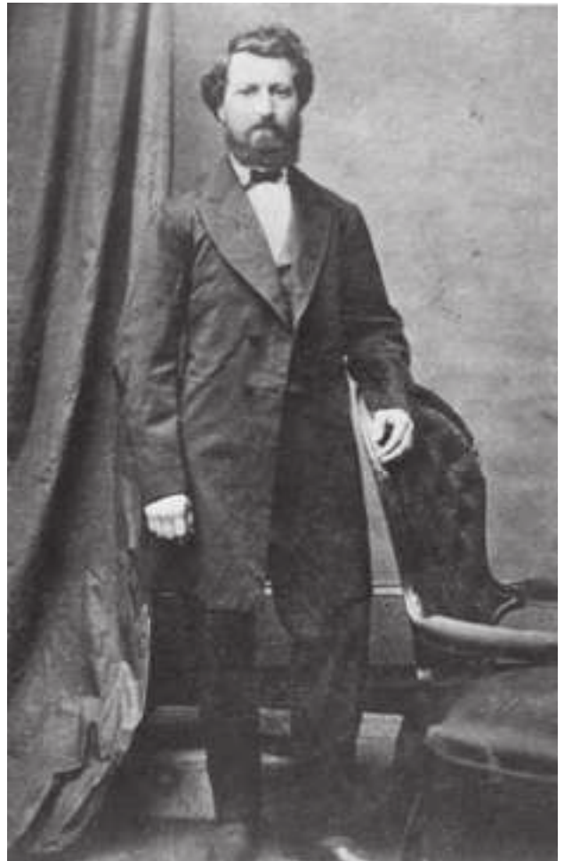
In 1884 Louis Riel worked as a teacher at the Jesuit St. Peter's Mission boarding school for Métis in Sun River, Montana. In June 1884, he wrote that "My health suffers from the fatiguing regularity of having to look after children from six in the morning until eight at night, on Sunday as well as on the days of the week." Saskatchewan Archives Board, R-A2305.

After 1885, as Euro-Canadian immigrants settled the West, the Métis were increasingly marginalized, living in shantytowns on the edges of town or just outside reserves. Few had the money to take up farming, and many relied on manual labour, such as freighting, lumbering, collecting buffalo bones, harvesting roots, and hunting and trapping, to survive. 11 Most of their communities lacked the finances to build schools, and public schools often were unwilling to admit Métis children. 12 A