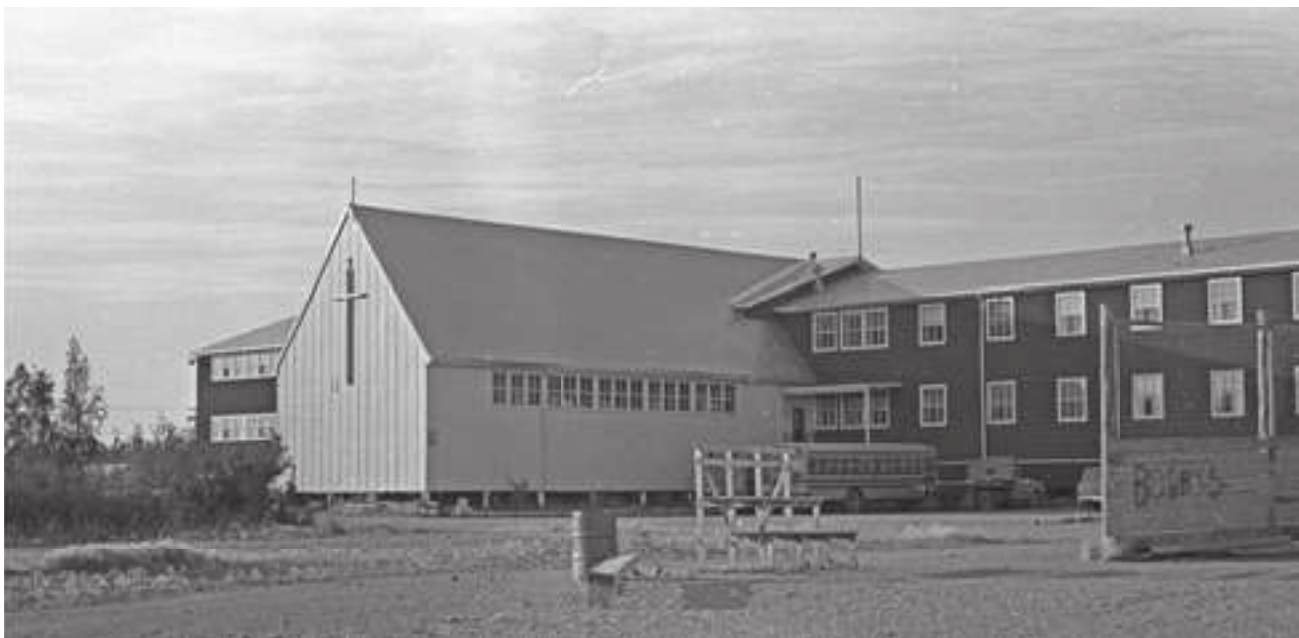
In 1998 three Grollier Hall staff members in Inuvik, Northwest Territories, were convicted of sexually abusing students.

a former employee of the Lytton residential school in British Columbia, pleaded guilty to sexual abuse charges. In 1995 the Royal Canadian Mounted Police initiated an investigation into all residential schools in British Columbia. By 2003, it had investigated over 900 abuse claims. Fourteen charges were laid, and jail sentences were imposed on eight former staff. 210 The staff had worked at the Roman Catholic schools at Williams Lake, Kuper Island, and Lower Post; the Anglican school at Lytton; and the United Church school at Port Alberni. In addition, former staff at the Roman Catholic Grollier Hall in Inuvik in the Northwest Territories, the Anglican school at Pelican Lake, the Roman Catholic school at St. Anne in Ontario, and the Roman Catholic Coudert Hall in Whitehorse, Yukon, also have been convicted on indecent assault charges. 211 In many other instances, cases did not proceed because the alleged perpetrators had died or because, with the passage of time, government lawyers concluded there was insufficient evidence on which to base a prosecution.