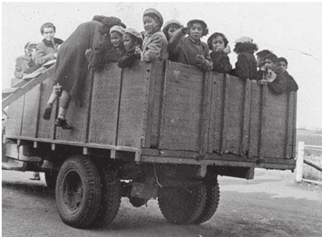
Girls at the Gordon's school in Saskatchewan being transported to church by truck in 1953.