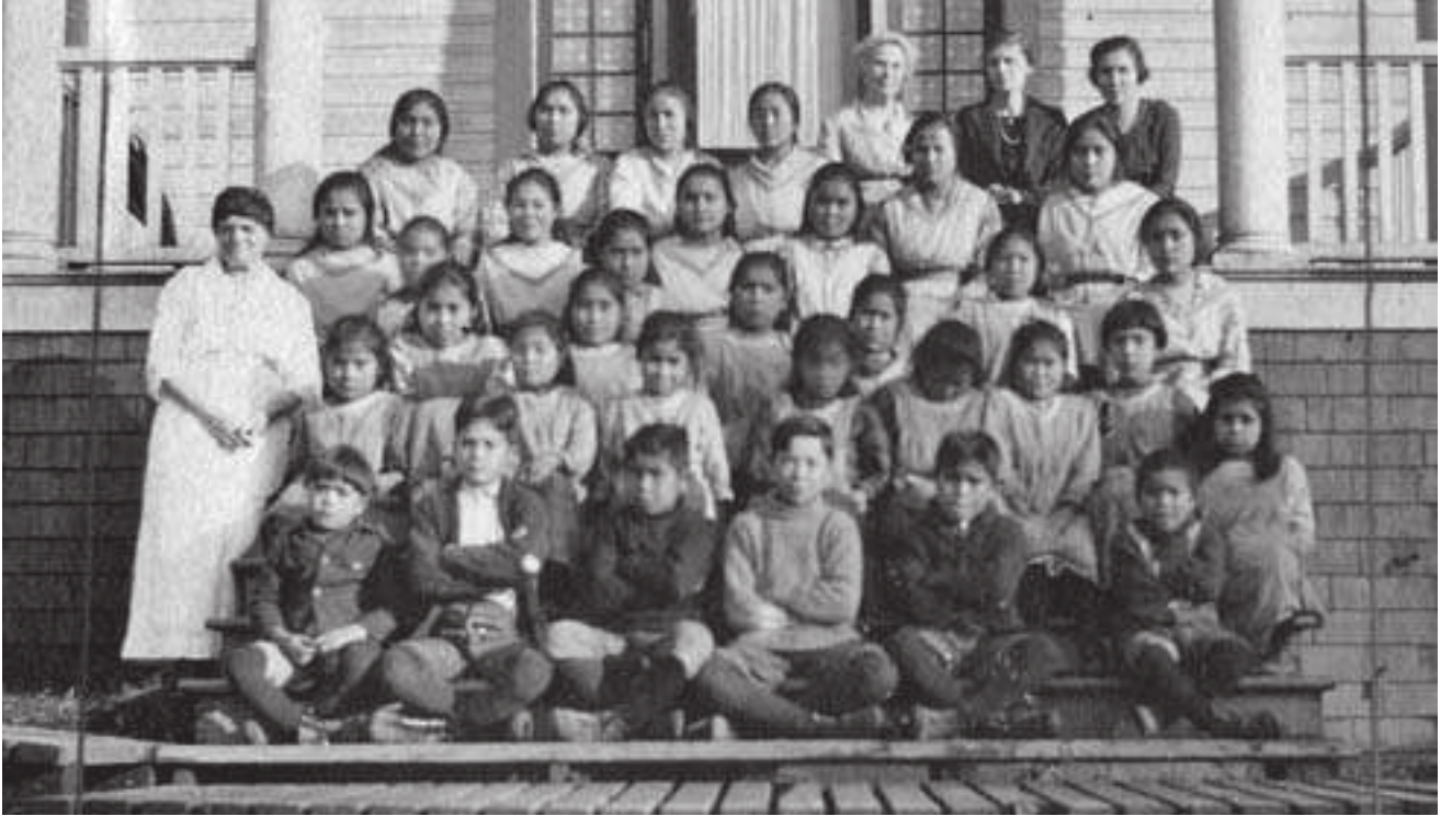
Pupils and staff of the Elizabeth Long Memorial House in Kitimaat, British Columbia, in 1922. In that year, parents pulled their children out of the school following the death of a student.

Parents also wrote letters of complaint to Ottawa about food and health in residential schools, starting as early as 1889. 262 In voicing these complaints, parents had to overcome their worries that by speaking out, they would be making matters worse for their children. 263