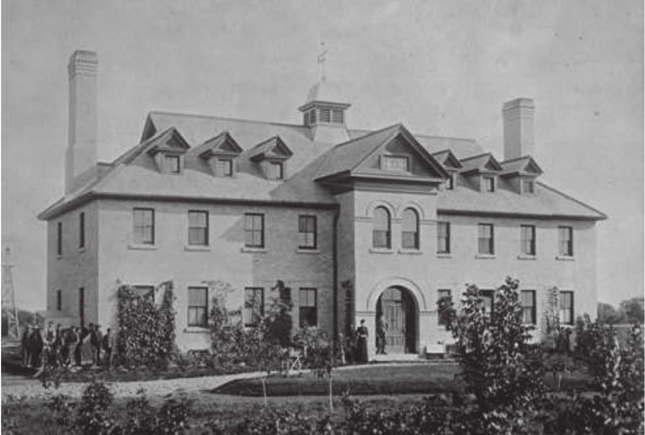
The principal of the Rupert's Land school in Manitoba was fired in 1899 after he was accused of kissing female students.