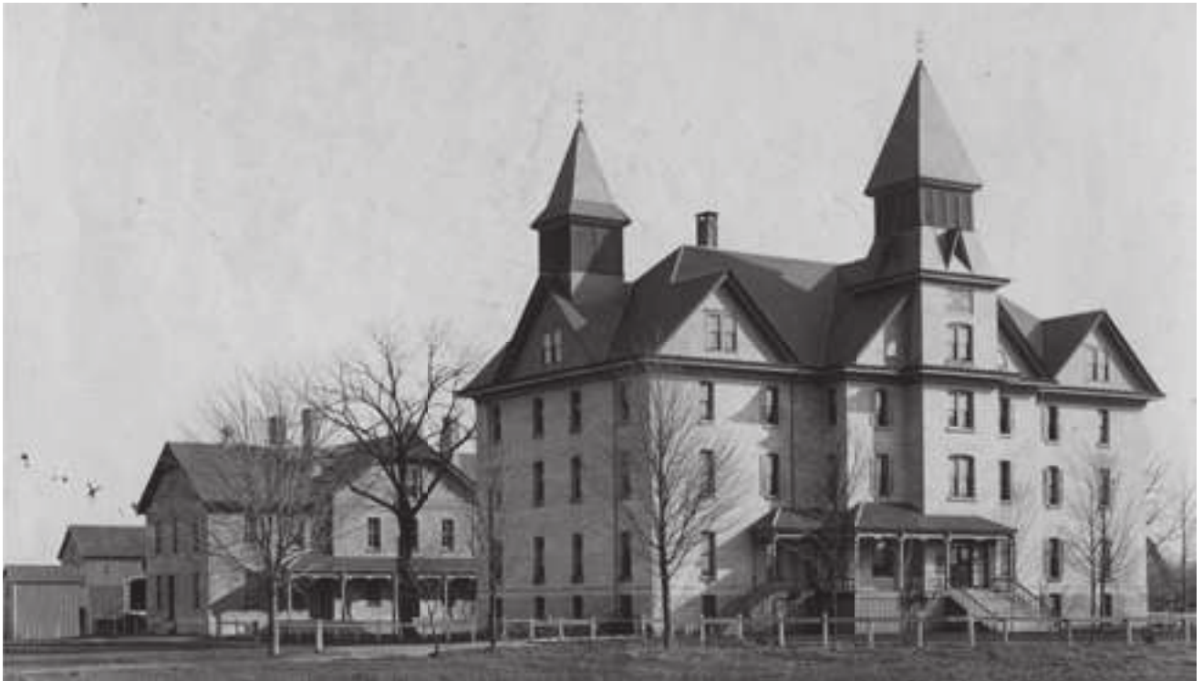
Parents brought their complaints about the principal of the Mount Elgin, Ontario, school before a justice of the peace in 1943. The United Church of Canada Archives, 90.162P1167N. (n.d.)

routine, the students rebelled. According to Rosa Bell, “They broke into the kitchen and threw pork everywhere. They also destroyed the supervisor’s supply of food, which was different from the food given to us. Some older boys brought us ice cream during the raid. We had never tasted ice cream! The rebellion was successful and a meeting was held to discuss the changes.” 273