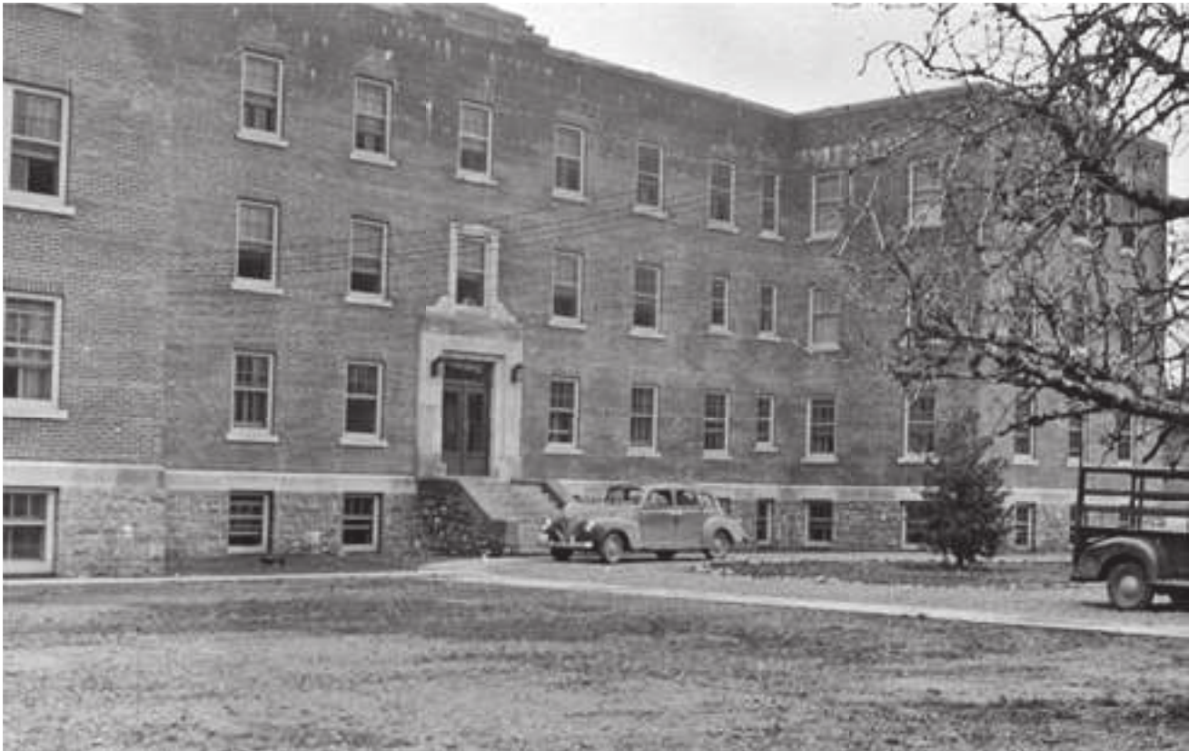
Following the conviction of a former dormitory supervisor at the Port Alberni, British Columbia, school, former students successfully sued both the Canadian government and the United Church. (1941).