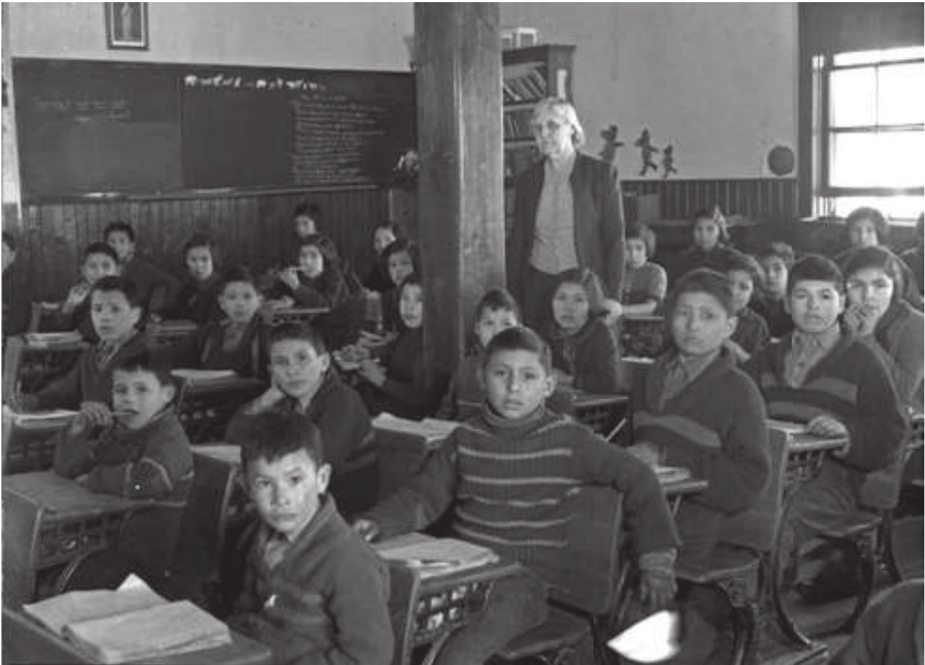
The message on the blackboard of this Anglican-run school in Lac la Ronge, Saskatchewan, in 1945 is "Thou Shalt Not Tell Lies."

stuff quite a bit. They didn't really care about our school-work, you know and help us with that." 57 In 1912 a federal government Indian agent wrote that teachers tended "to devote too much time to imparting religious instruction to the children as compared with the imparting of secular knowledge." 58 Attracting and keeping good teachers was an ongoing problem throughout the system's history. At one point, when public school teachers in the West were earning between $500 and $650 a year, Indian Affairs was allowing residential schools $300 a year for teachers. 59 In the 1950s, the federal government began hiring and paying teachers directly, leading to long-needed salary improvements.