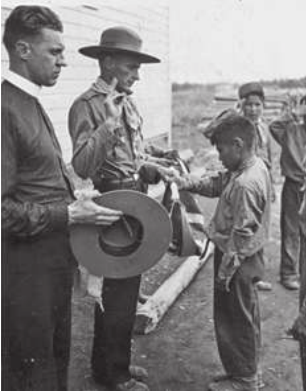
A student at the All Saints School in Aklavik, Northwest Territories, taking his Cub Scout oath.