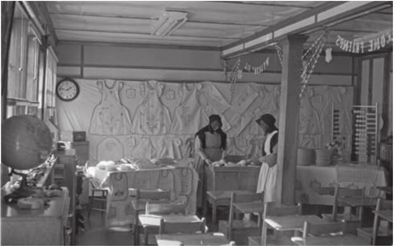
Nuns working on crafts at Immaculate Conception School in Aklavik, Northwest Territories, 1955.